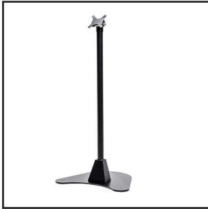
mUNITE FLOOR KIOSK STAND BLK & WHT BLK 37954700 WHT 37954690 Tablet Kiosk Stand, 45-Inch Height, Floor Stand