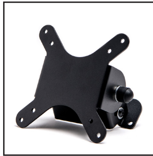
mUNITE WALL MOUNT BLK & WHT BLK 37954620 WHT 37954610 Tablet Wall Mount