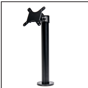
mUNITE 18 MOUNT BLK & WHT BLK 37954820 WHT 37954810 Tablet Mount, 46cm Pole, Counter Top & Edge Mount, Installation Kit Included