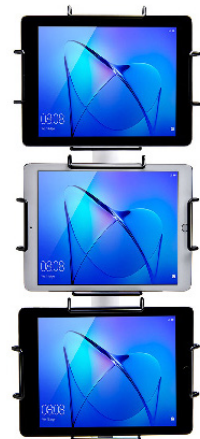
Tri Mount Tilt: Tablet tilt: + 90°, -60° Tilt Angle: +45°, -45°a WxDxH: 116 mm wide 178.5 mm deep 585 mm high Weight: 2.69 Kg VESA Weight Capacity: 8.5 Kg Monitor Size: 10in to 32in

The mUnite series is perfect for kiosk applications, self-service check-in and check-out, welcome message, ordering, meeting room reservations, online pick-up and more. All models available in black or white. mUnite mounts, stands & kiosks * Tablet, enclosure and printer not included