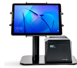
EZPOS Tilt: +45°, -45° WxDxH: 300 mm wide 200 mm deep 206 mm high (To top of post) Weight: 2.28 Kg