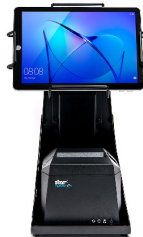
EZ100 Tilt: +45°, -45° WxDxH: 176 mm wide 268 mm deep 340 mm high Weight: 4 Kg