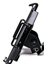
Wall Mount Tilt: +35°, -30° WxDxH: 66.2 mm deep 116 mm wide 116 mm high Weight: 0.8 Kg