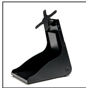
mUNITE EZ100 BLK & WHT BLK 37954780 WHT 37954770 EZ100 Desk Stand for Star TSP100, TSP650II or TSP700II Series