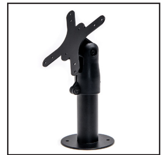
mUNITE 7 MOUNT BLK & WHT BLK 37954800 WHT 37954790 Tablet Mount, 18cm Pole, Counter Top Mount, Installation Kit Included