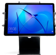
EZDesk Tilt: +115°, -15° WxDxH: 150 mm wide 221 mm deep 183 mm high Weight: 2.28 Kg EZDesk can be mounted for secure installation.

With the mUnite EZ Desk Kiosk and Floor Kiosk stands, Star Micronics has created two sturdy yet easy-to-move tablet displays built for any self-service or customer engagement application. These stands are free-standing with weighted bottoms to keep them firmly in place. Presenting an attractive, minimalist design, Star's kiosk stands can be used in any retail or hospitality environment, allowing customers to check in or place orders independently or used for visitor management or customer information. * Tablet, enclosure and printer not included