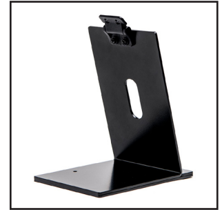
mUNITE EZDESK KIOSK STAND BLK & WHT BLK 37954740 WHT 37954730 Tablet Kiosk Stand, Compatible with mEnclosure Universal Only