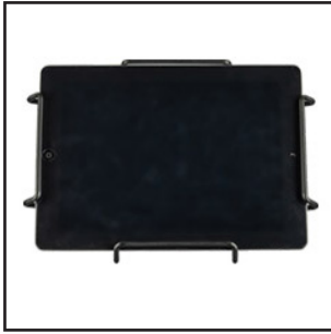
mENCLOSURE UNIVERSAL BLK & WHT BLK 37950830 WHT 37950850 Tablet Enclosure, Universal, mUnite Compatible, 100mm VESA, Lock Key