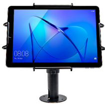
Mount 7 Tilt Angle: +150°, -15° Rotation ± 180° WxDxH: 104.9 mm wide 116 mm deep 247 mm high VESA Weight Capacity: 4 Kg Monitor Size: from 12 inch

Star Micronics has created multiple stylish tablet mounts to free up and declutter workspace while keeping valuables secured in one area. They attach to most walls and countertops with everything needed to get set up included. Incredibly modern and space-saving, these tablet mounts are perfect for online ordering for the restaurant or QSR industry, retail, hospitality industry, or any establishment where tablets are regularly used and can be stationary. Tablets are well-protected and easily accessible while out of the way in busy environments. *Tablet, enclosure and printer not included