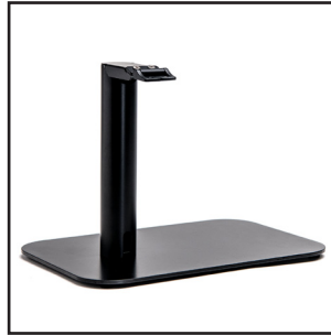
mUNITE EZPOS STAND BLK & WHT BLK 37954720 WHT 37954710 Tablet Stand