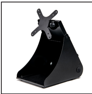
mUNITE EZ3 STAND BLK & WHT BLK 37954760 WHT 37954750 Tablet Stand, mC-Print3 Series, Includes Customer Facing Display Mount