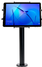
Mount 18 Tilt: +90°, -60° WxDxH: 150 mm wide 116 mm deep 437 mm high Weight: 3.5 Kg VESA Weight Capacity: 8.5 Kg Monitor Size: 10in to 32in