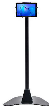
Floor Kiosk Stand Tilt: +90°, -10° WxDxH: 474 mm wide 573 mm deep 1179 mm high Weight: 8.5 Kg