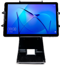
EZ3 Tilt: +50°, -5° WxDxH: 162 mm wide 229 mm deep 280 mm high Weight: 3.8 Kg

Freshen your point-of-sale with Star's wide selection of mUnite desktop tablet stands. Keeping cables together and off the checkout counter, these upscale stands are made to house and protect a variety of Star printers, providing stability and style. They use universal VESA mounting to secure the tablet of your choice, giving the freedom to tilt the screen while including room for a second customer-facing option. Stylishly space-saving, Star's desktop stands present a clean and attractive look to your customers. * Tablet, enclosure and printer not included